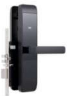
Hotel Smart Lock